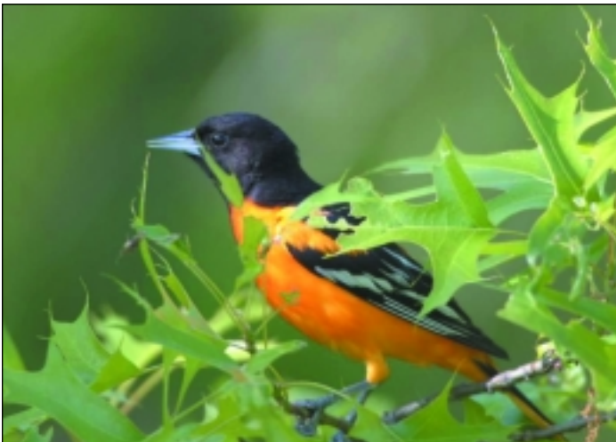
Baltimore Oriole, 67 feet high up in a pin oak.

This past May he rented a 60-foot boom lift machine and spent the first hours of light every day for a week photographing warblers, vireos and orioles in their playground high in the canopy of a hardwood forest. Braving wind, rain and vertigo he would wait patiently for his chance to capture on film common backyard birds in an environment rarely seen by the occasional birdwatcher.