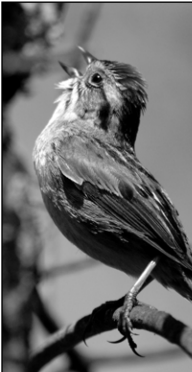
Swamp Sparrow by Blaine Rothausser