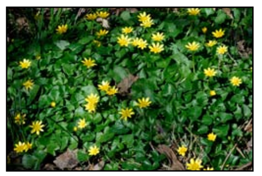
Lesser celandine (Ranunculus ficaria) covering forest floor

uch of what you see as green outside your window has come from faraway places like China, Japan and South America. Floral malefactors have taken root in our soil, all in a blink of geologic time. Invasive species integration