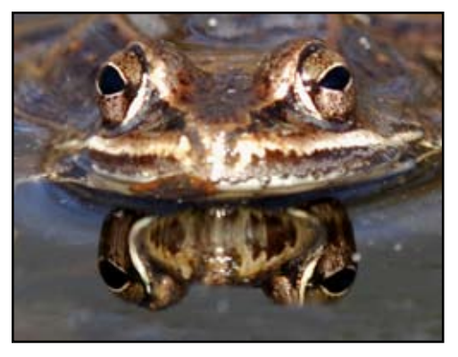
Wood Frog.

We still need a strong effort to preserve open space in the Great Swamp Watershed and throughout NJ. Learn the basics of open space and farmland preservation planning, and take part in an interactive open space planning activity.