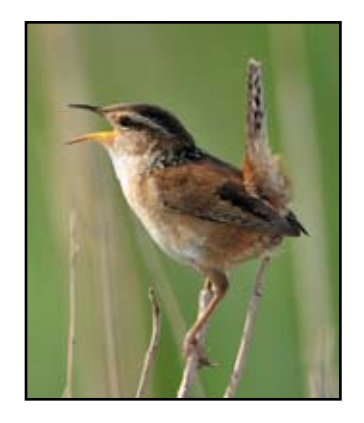
Marsh Wren.

Enhancing your school ground creates habitat for wildlife, can help improve water quality, and offers students areas to study without costly field trips. You don't need a country setting for habitat enhancement to work, and to offer teaching opportunities. Learn about the process of creating an outdoor place for learning, including mapping, site design, and correlation to your existing curriculum. This workshop is suited for K-12 educators in all subject areas. This program will spend some time outside.