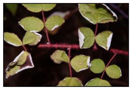
Wineberry (Rubus phoenicolasius)

7. Tall Reed Grass ( Phragmites australis ): Common in open wetland areas, specifically the Chatham Township high tension wire right-of-way between southern Boulevard and Myersville Road. Native Cattail ( Typha sp. ) and