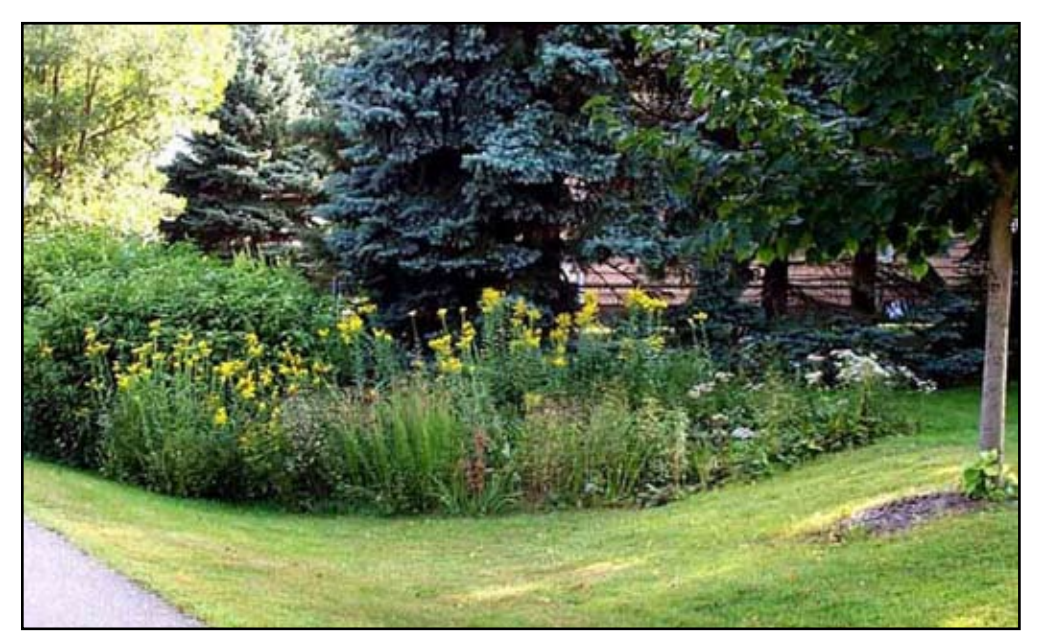
An established rain garden in bloom. Garden intercepts runoff before it reaches the impervious surface.

scale controls that are distributed throughout the site. These designs have many functions that incorporate alternative stormwater management practices. Some designs include functional landscaping that act as stormwater facilities, flatter grades to lands, depression storage and open drainage swales. The system of these small controls can reduce or eliminate the need for a centralized best management practice (BMP) facility that controls stormwater runoff. Although traditional stormwater control measures have been documented to effectively remove pollutants, the natural hydrology is still badly affected which can have severe damaging effects on ecosystems, even when water quality is not compromised on site.